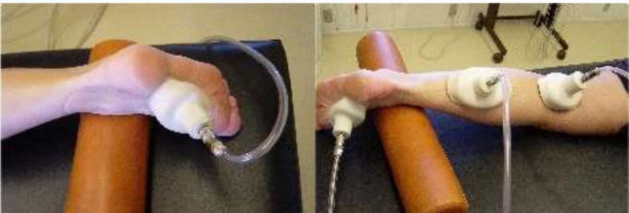
Triggerpoints for Column stimulated with Suction Cups P2-045 - 20 min.

Full body Treatment after Local treatment