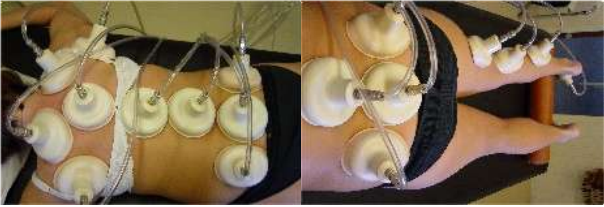
Suction Cups on Triggerpoints P2-045 - 20 min.